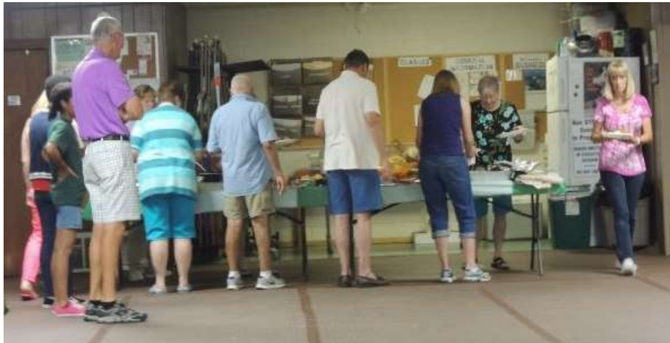
The Club provided BBQ Beef and Turkey... Everyone brought great side dishes!