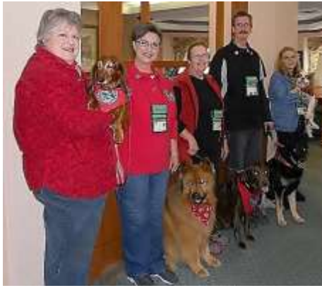
TDI Teams at Grace Presbyterian