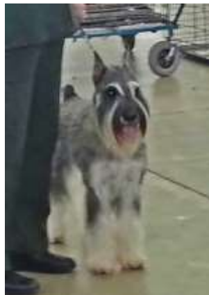
Champ at a Show